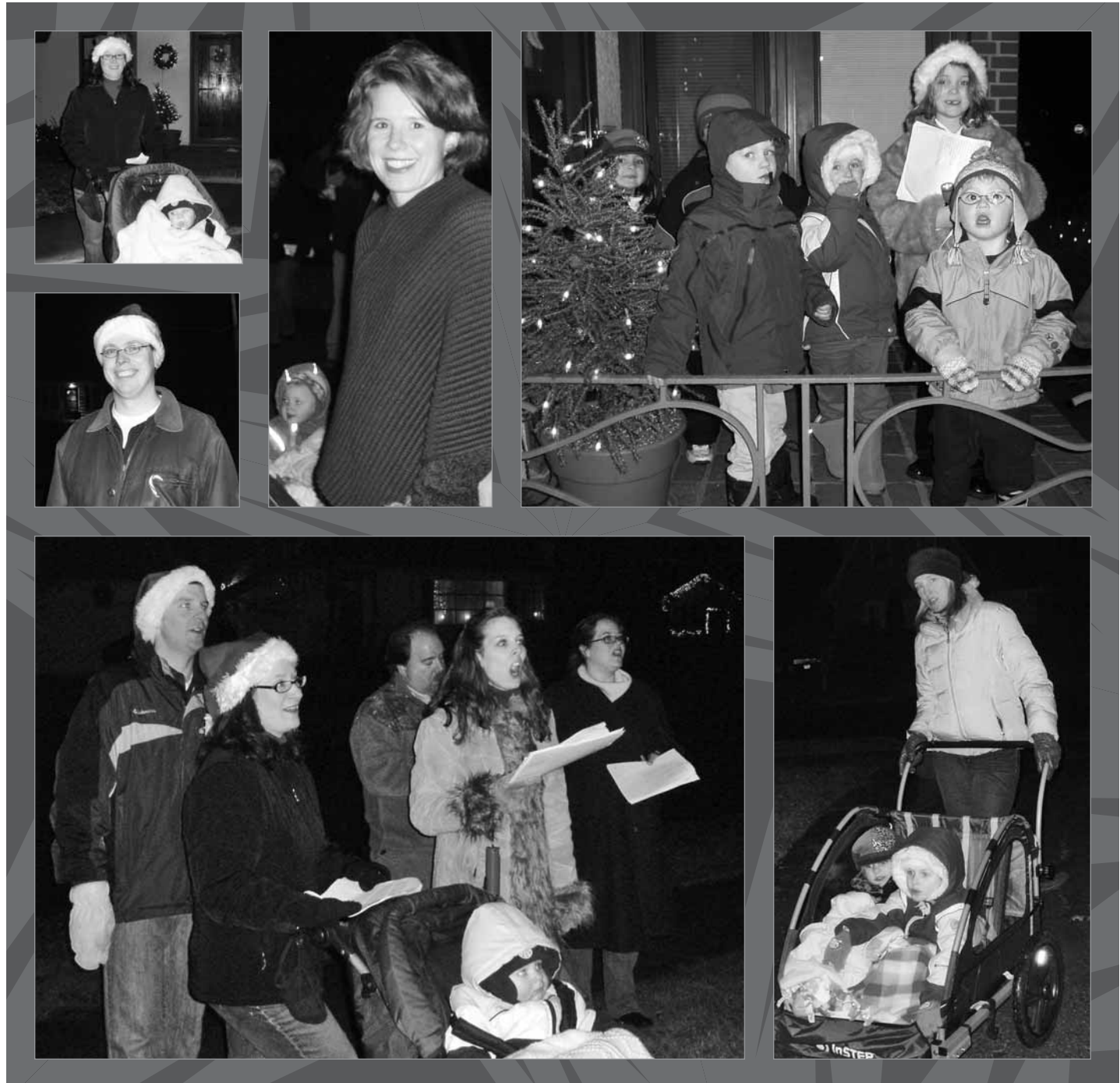
Christmas carolers deliver a joyful holiday sound to Astor Park!